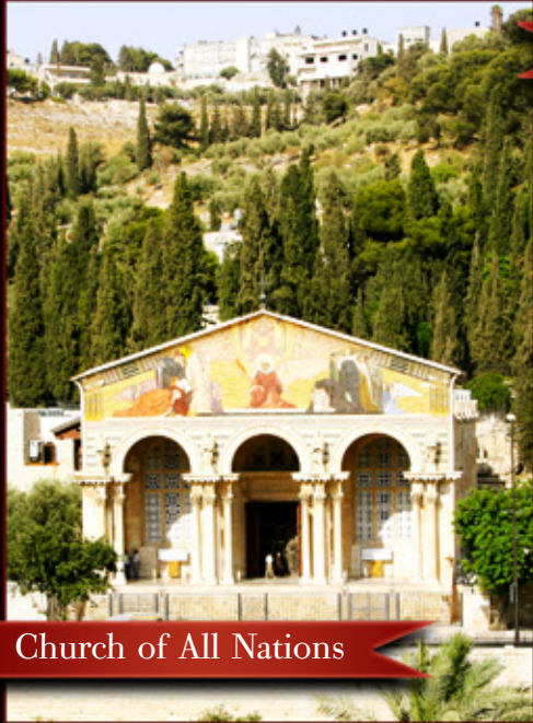
Church of All Nations