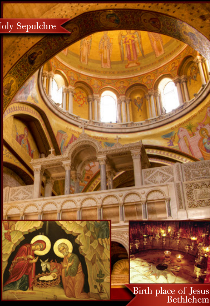
Birth place of Jesus Bethlehem