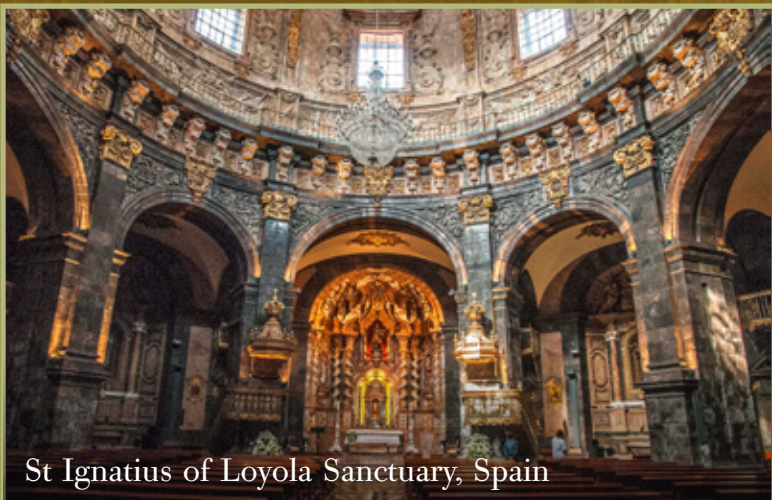
St Ignatius of Loyola Sanctuary, Spain

Space is Limited, go to www.JMJtours.com/HolySpirit to Register