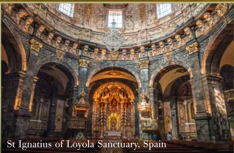
St Ignatius of Loyola Sanctuary, Spain

Space is limited, for complete information, visit: www.JMJtours.com/HolySpirit To register, use our online form or Mail completed form on the back