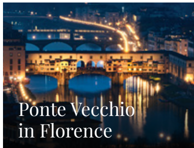
Ponte Vecchio in Florence