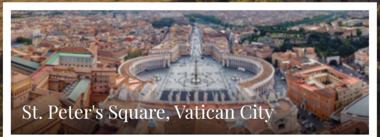
St. Peter's Square, Vatican City

Early Registration SAVE $100 SEE WEBSITE FOR DUE DATE