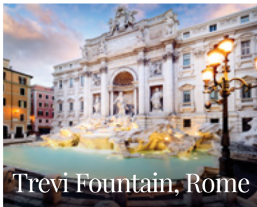
Trevi Fountain, Rome