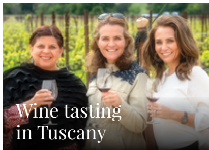
Wine tasting in Tuscany

$3422* + $475 Airport Taxes, Security & Airline Fuel Fees $3897 Total* Per Person, double occupancy *Includes $100 early registration discount. See website for details