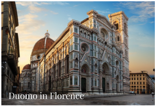
Duomo in Florence