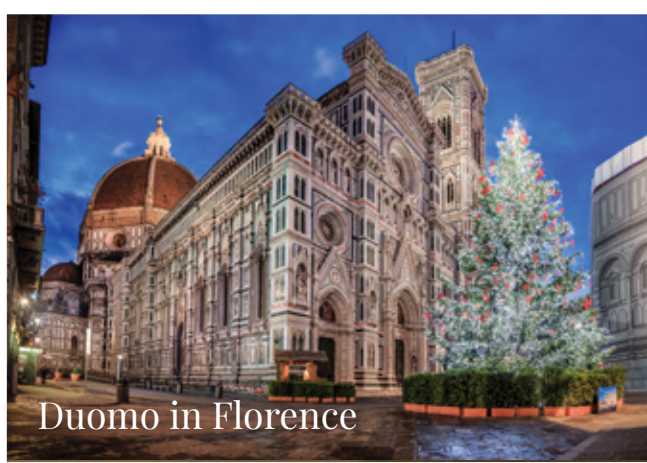
Duomo in Florence