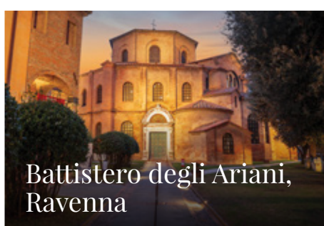
Battistero degli Ariani, Ravenna