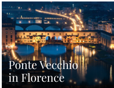
Ponte Vecchio in Florence