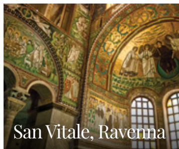
San Vitale, Ravenna