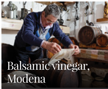
Balsamic vinegar, Modena