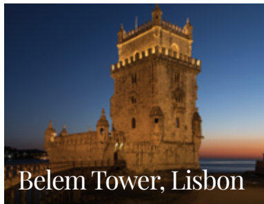
Belem Tower, Lisbon