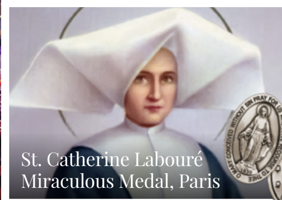
St. Catherine Labouré Miraculous Medal, Paris

Early Registration SAVE $100 SEE WEBSITE FOR DUE DATE