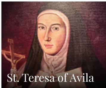
St. Teresa of Avila