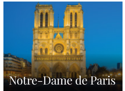
Notre-Dame de Paris

$4292* + $557 Airport Taxes, Security & Airline Fuel Fees